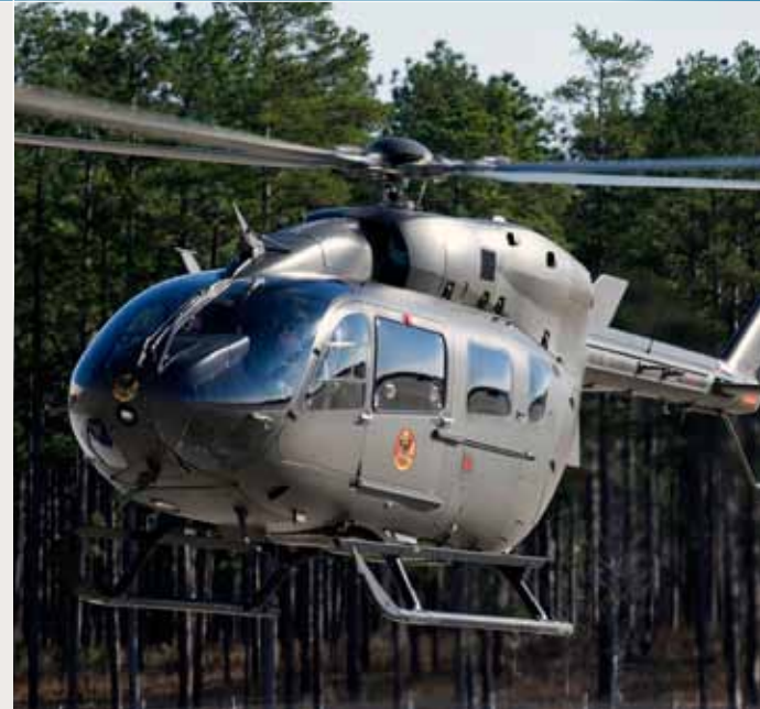
HELOTRAC 2X™ System is currently being used on the UH-72A Lakota and can be utilized on other aircraft.